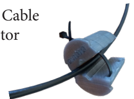
Cable Retention Plug and Ties