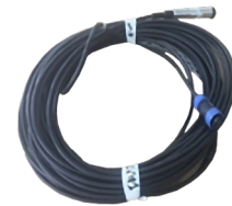
Sensor with Cable and Connector